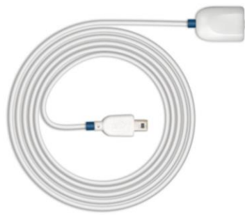
Fig. 1. BIOSIGNALSPLUX LIGHT (LUX) SENSOR (STANDARD VERSION).