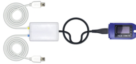
Fig. 1. User-friendly finger clip sensor for SpO2 and heart rate monitoring.

This comfortable and user-friendly finger clip sensor was designed to measure reliable oxygen saturation levels (%) and heart rate (bpm) information. The built-in colour LCD display displays all measured values and signals and allows this sensor to be used both as standalone device or as biosignalsplux sensor within our OpenSignals (r)evolution software .