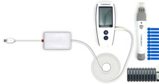
Fig. 1. User-friendly glucose meter reader.

This user-friendly glucose meter measures reliable glucose level data (mg/dL) using blood samples taken from fingertips, palms, forearms, upper arms, or calves. The built-in colour LCD display displays the measured glucose level and allows this sensor to be used both as standalone device or as biosignalsplux sensor within OpenSignals (r)evolution software . This sensor comes with 10 disposable single-use lancets and test strips to take and prepare the needed blood samples.